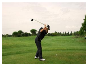
Taking a swing