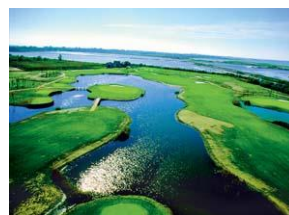
Grado Golf Club